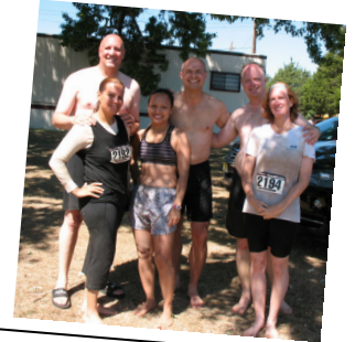
Team Fit-4-Life After Mud Mountain, Marsh Madness, and Swamp Drop. We survived, barely. Congrats Team!!