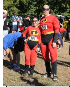
Our Mud Run Competition. The Incredibles? Not Fair